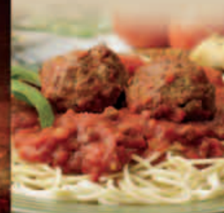
Spaghetti & Meatballs

A cream sauce made with Parmesan & Romano over fettuccini 9.49 Add Chicken 1.99