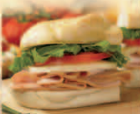
Turkey & Cheese Sub

American, provolone, mozzarella cheese, lettuce, tomatoes, onions & mayonnaise 5.89