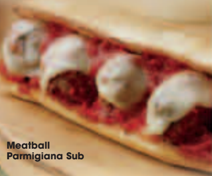
Meatball Parmigiana Sub

Grilled broccoli, mushroom, onion, tomato & mozzarella cheese 6.29